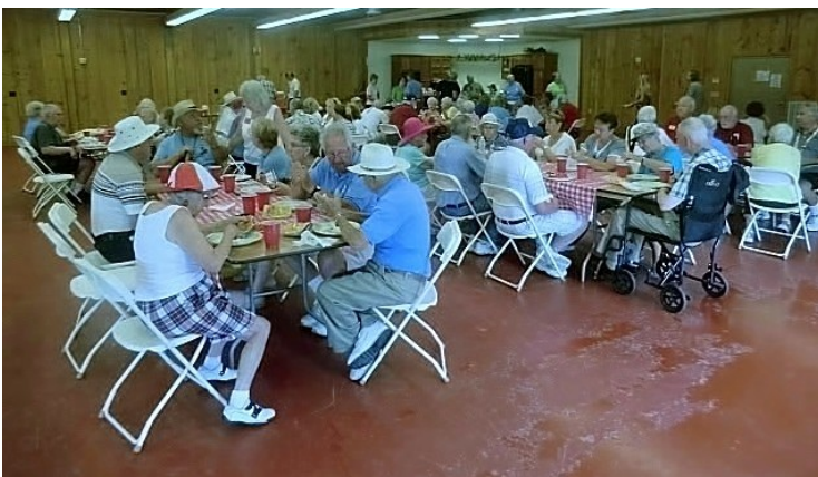
YNCT Lunch Wagon Boy—Do we like to eat!