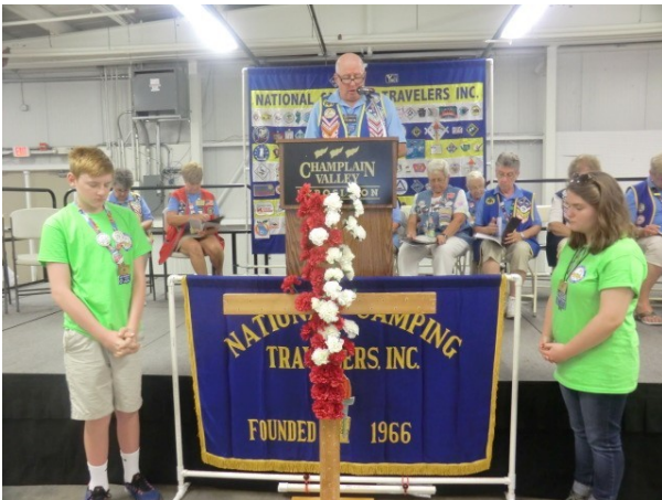
Remembering those we have lost