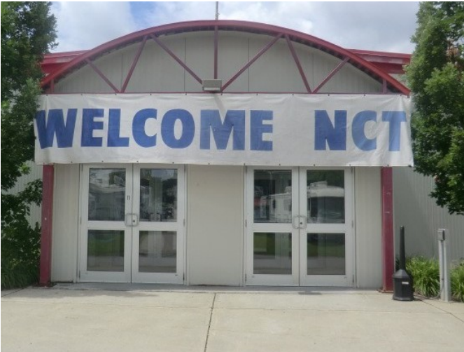
Ready to Begin!