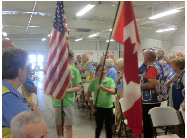
YNCT Bringing in The Flags of our Countries