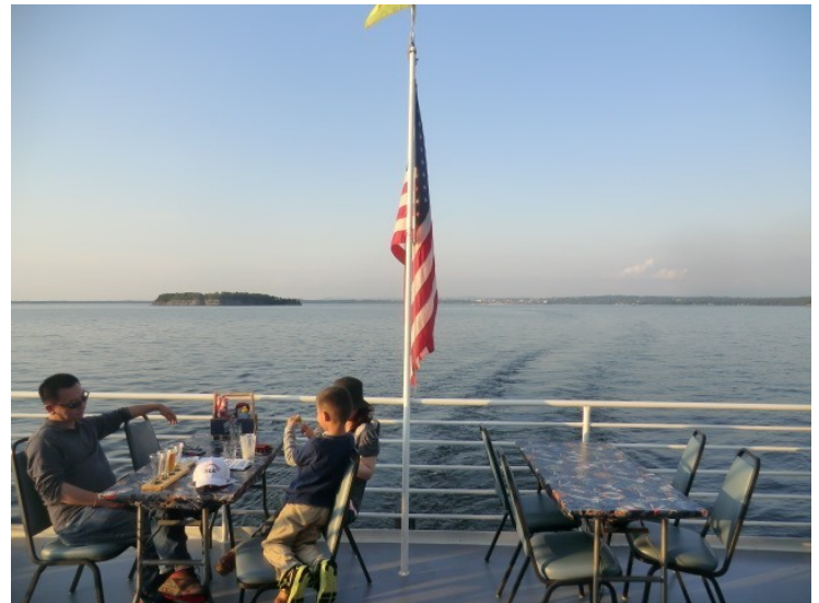
Dinner Cruise on Lake Champlain