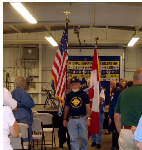
Retiring our Colors Where did the week go?